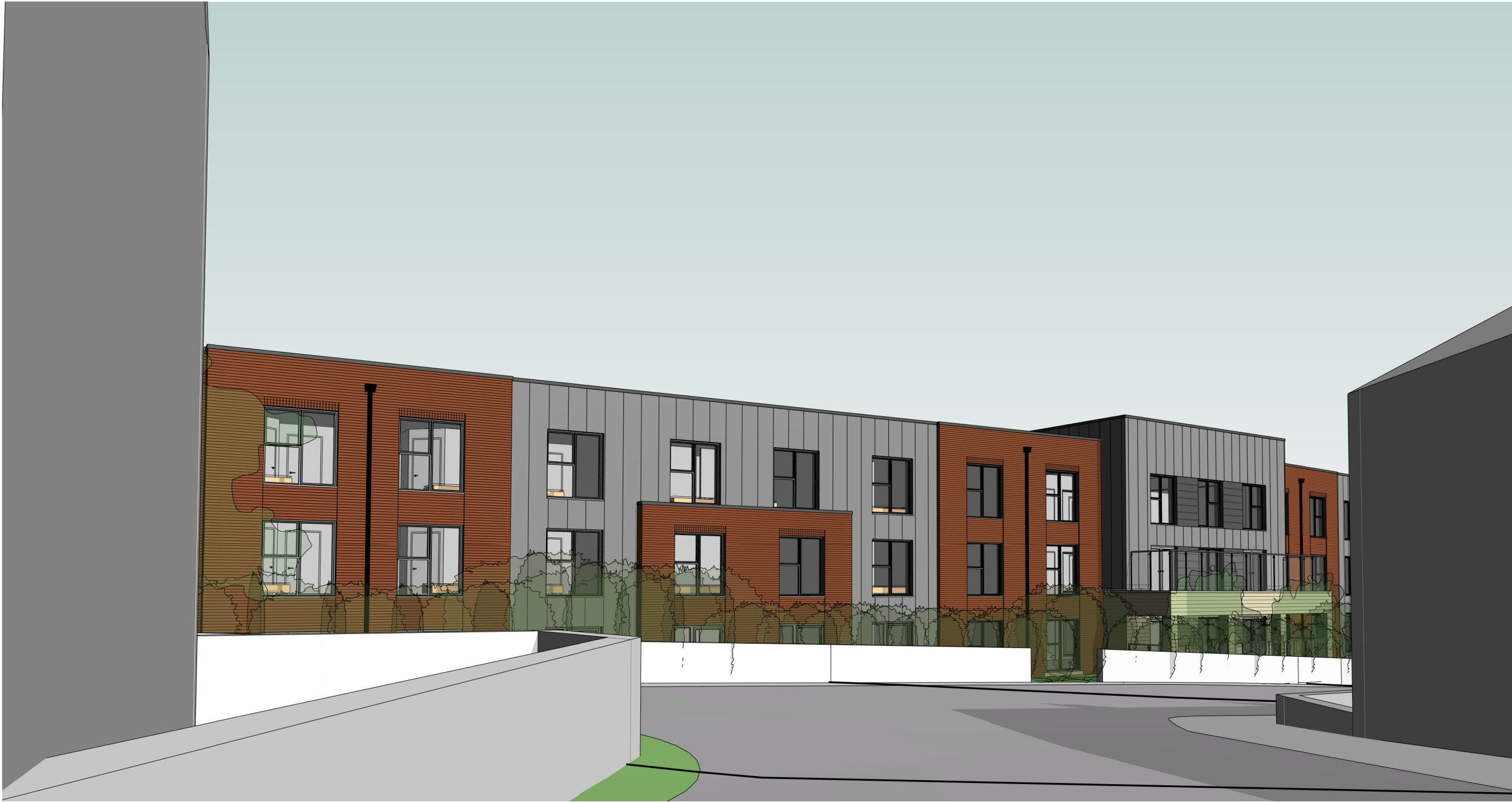
3D View 6 - Lord Street