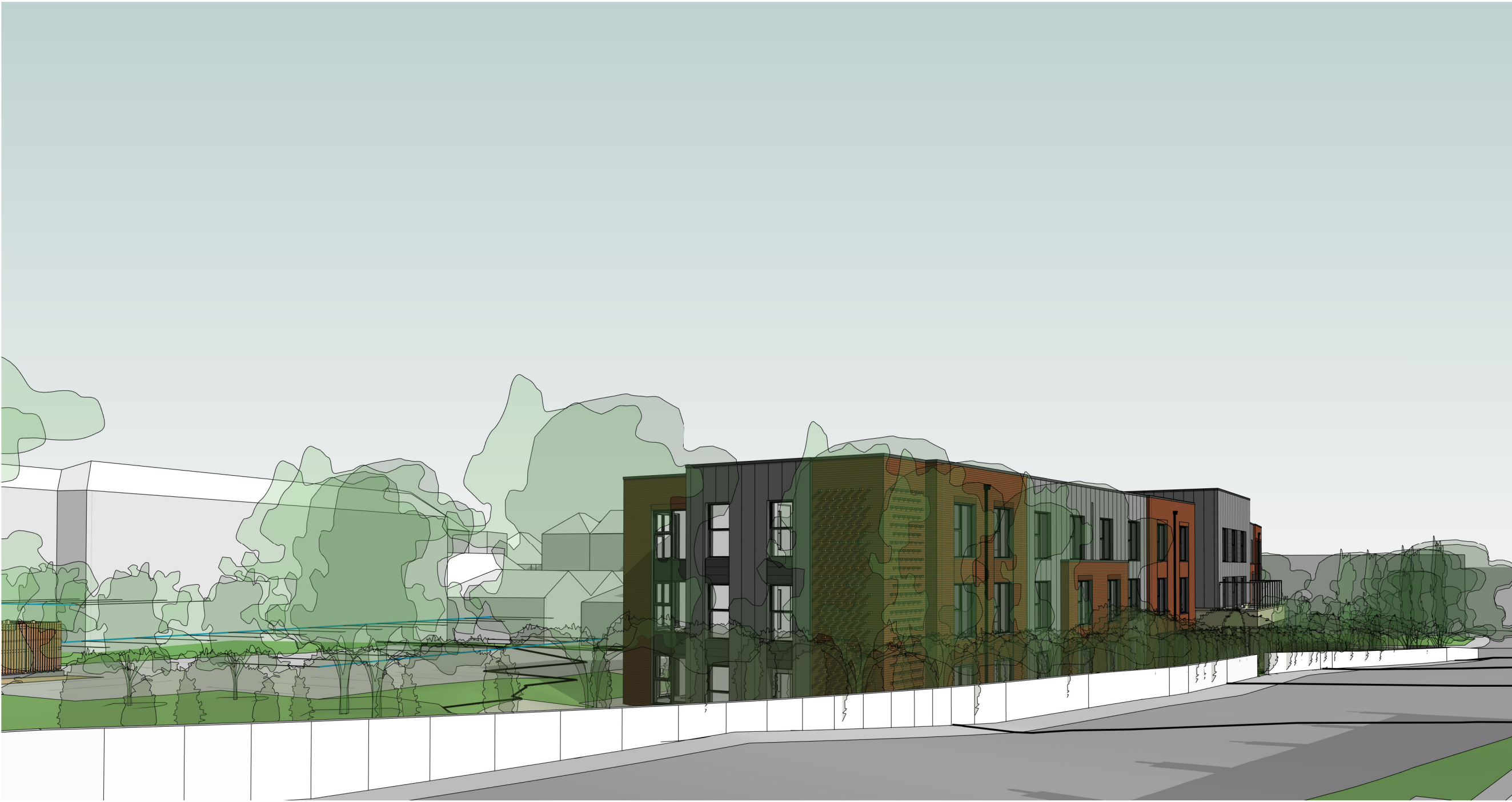
3D View 5 - Park Street 2