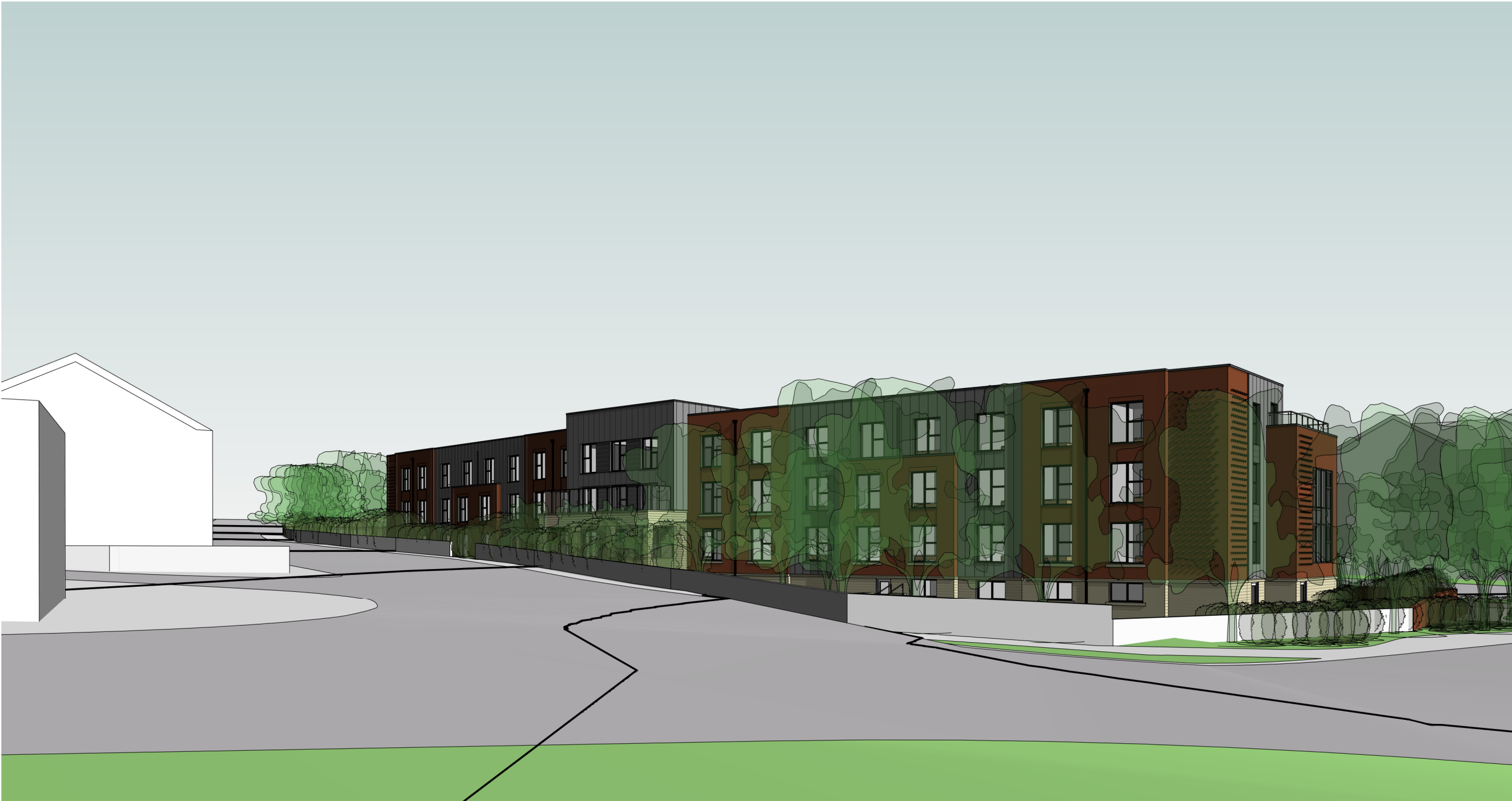
3D View 7 - Junction of A536 and Park Green