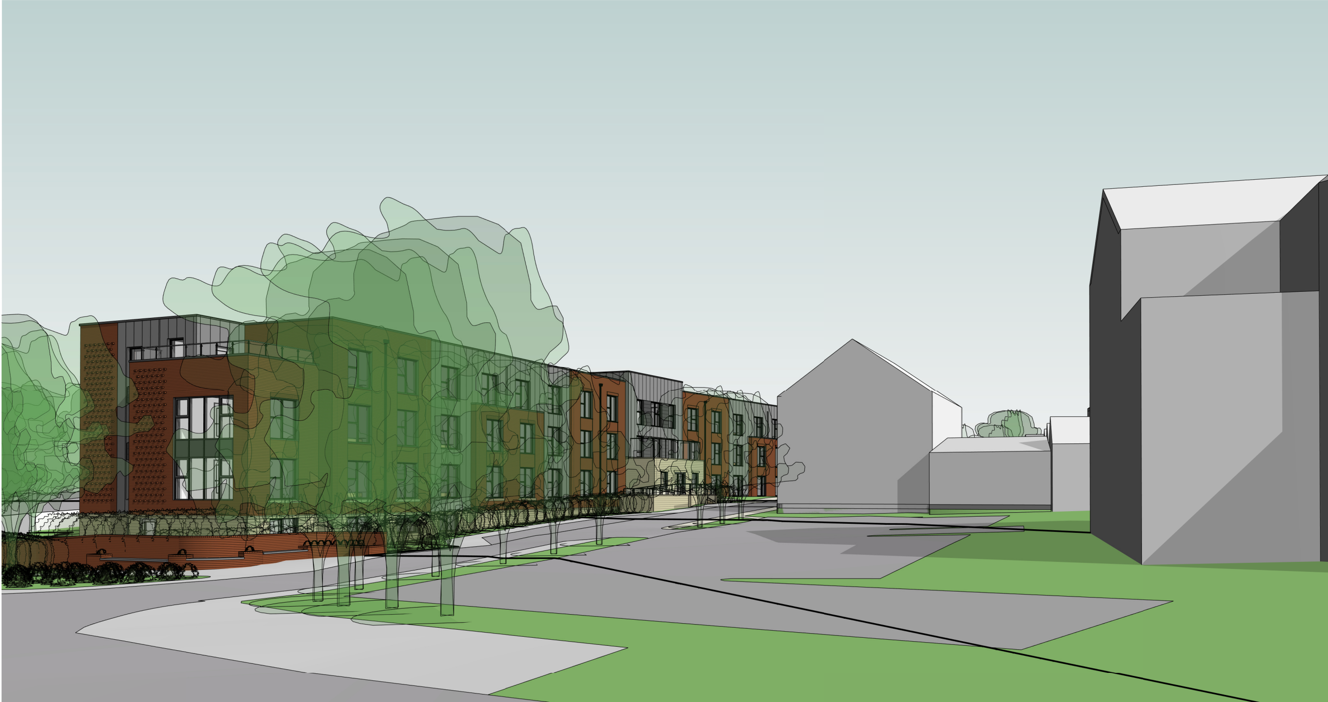
3D View 2 - Corner of Parsonage St and Parl Green