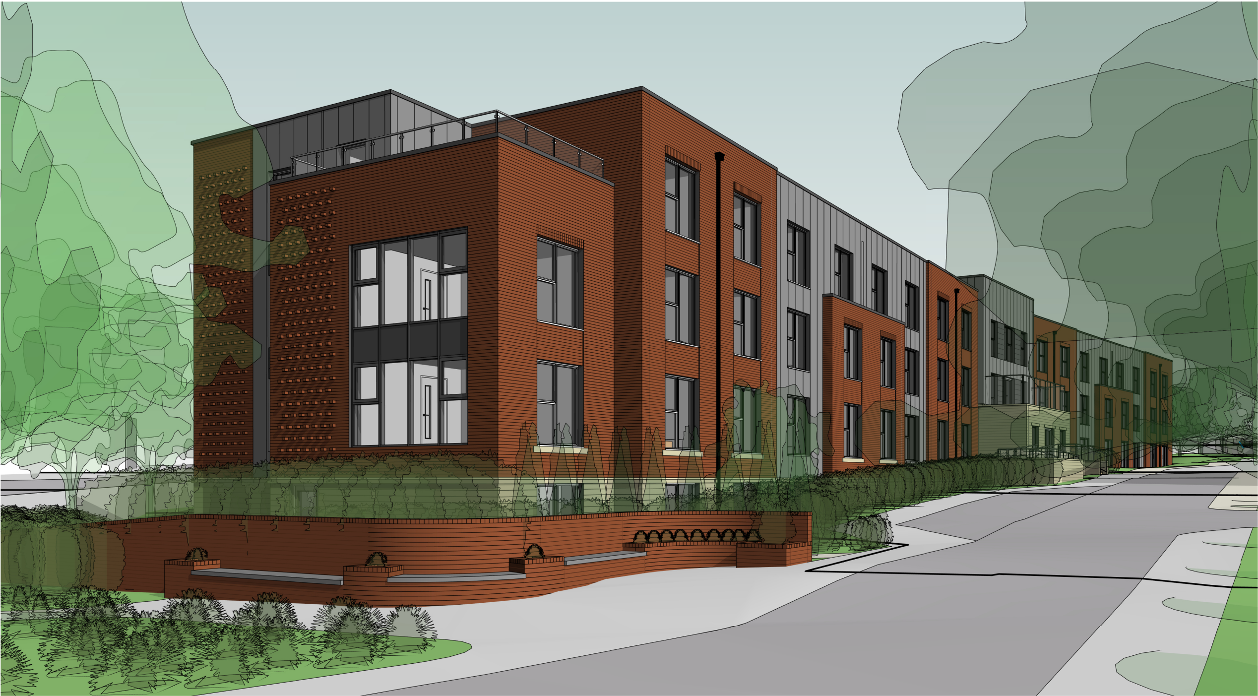
3D View 9 - Park Lane, Parsonage