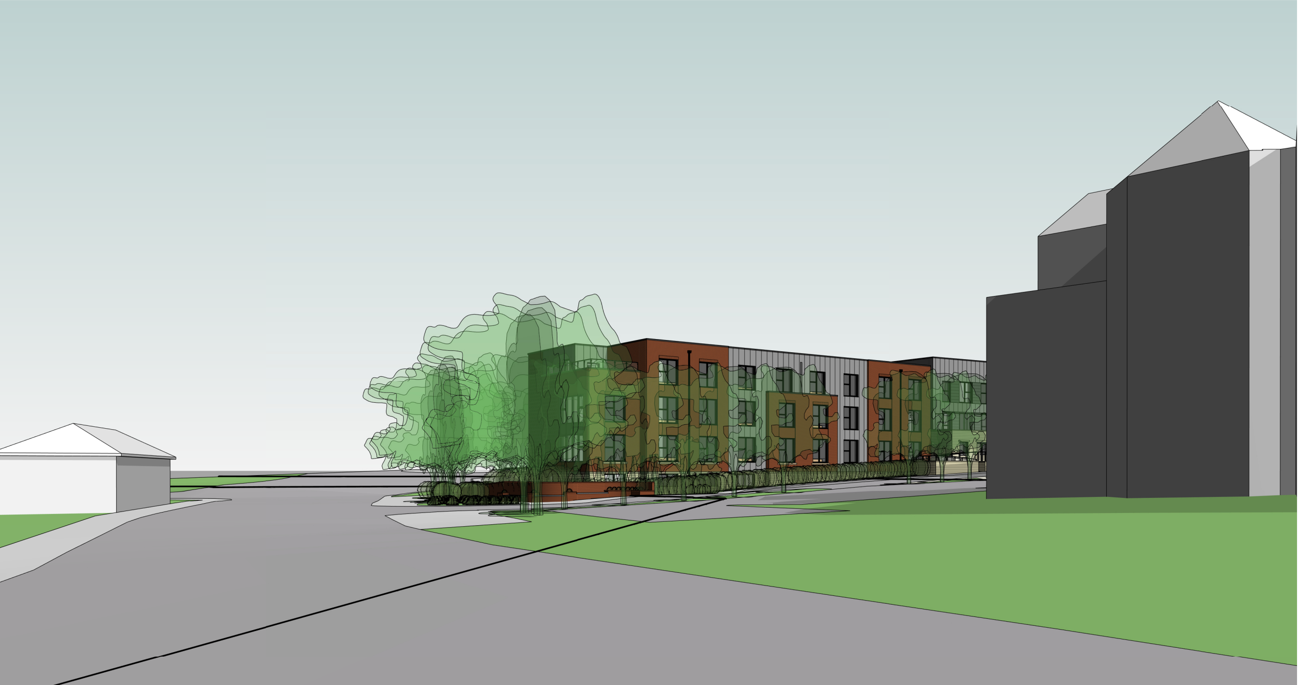
3D View 1 - Park Lane