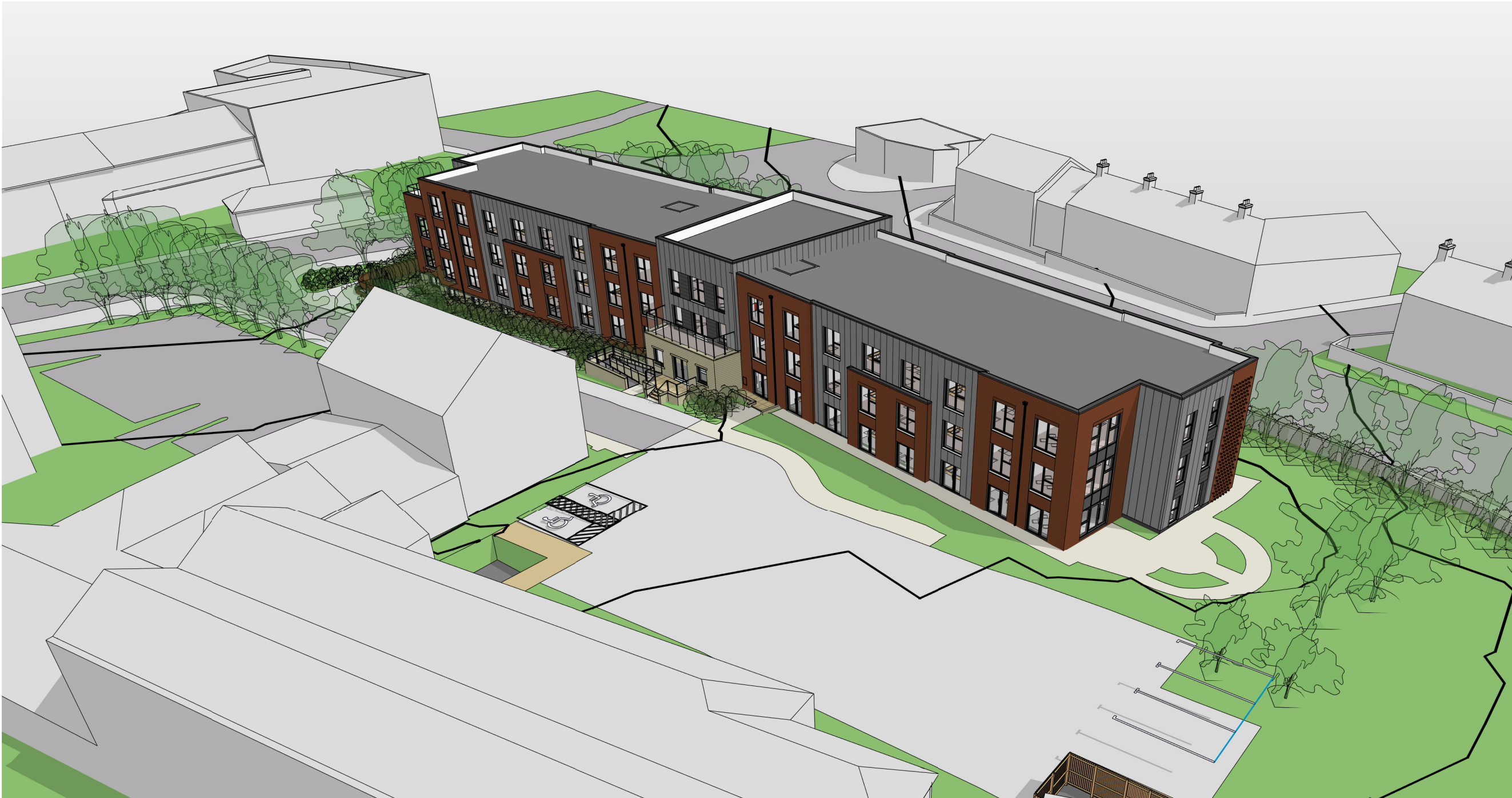
3D View 4 - Aerial View