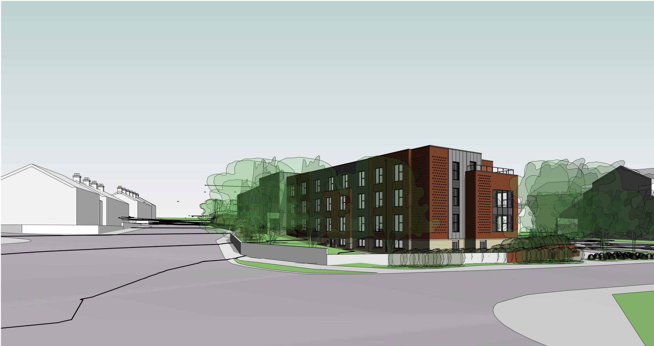
3D View 8 - Corner of Park St and Park Green